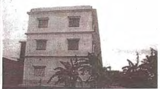
PHOTOGRAPHS OF THE INSTITUTION